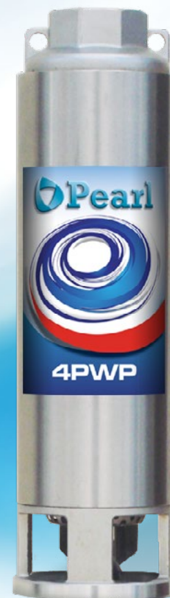
Tabla de Selección